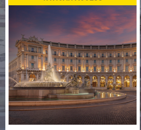
8 DAY ITINERARY Venice > Florence > Rome

VENICE, FLORENCE & ROME WITH AFTER-HOURS VATICAN ACCESS