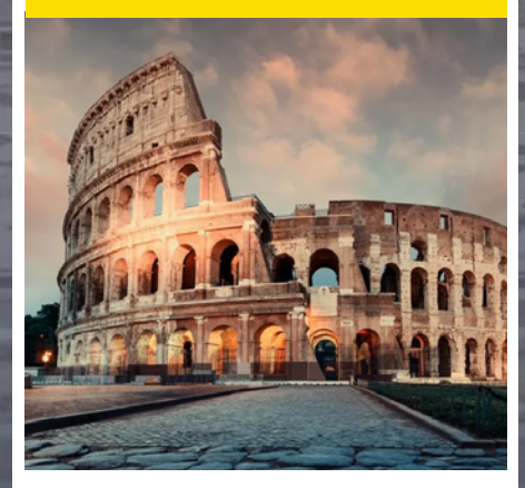
8 DAY ITINERARY Rome > Naples > Sorrento

ROME, NAPLES & SORRENTO WITH EXCLUSIVE VATICAN EXPERIENCE